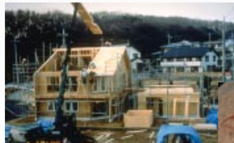
R-Control® SIP Construction in Japan

Many specialists predicted that newer structures, subject to tough quake-proofing standards, would not experience severe damage. However, many of these structures turned out to be vulnerable to the quake. Damage to traditionally built Japanese "beam type" homes was even worse.